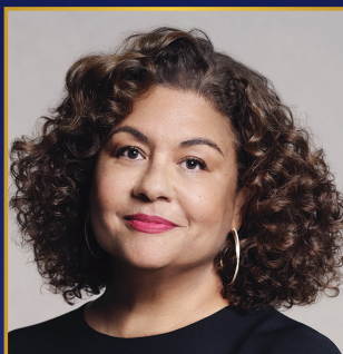
THE MELLON FOUNDATION

19-time Grammy-Winning Musician, Best-Selling Author, DC Native