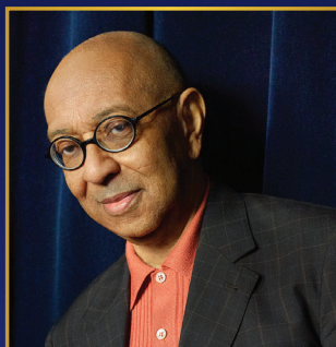
GEORGE C. WOLFE