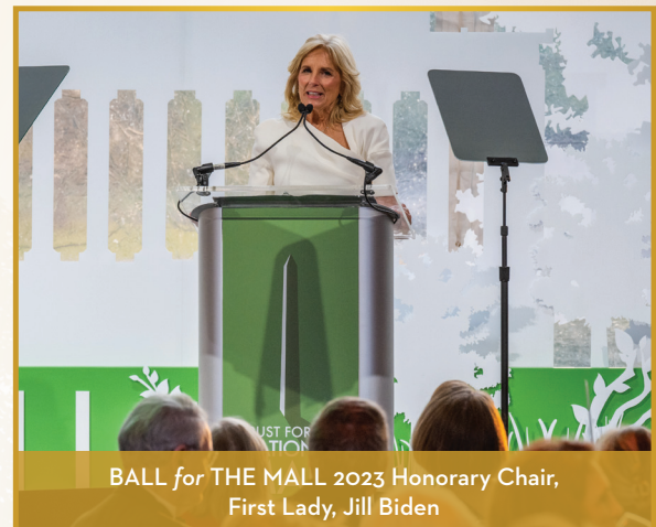
BALL for THE MALL 2023 Honorary Chair, First Lady, Jill Biden